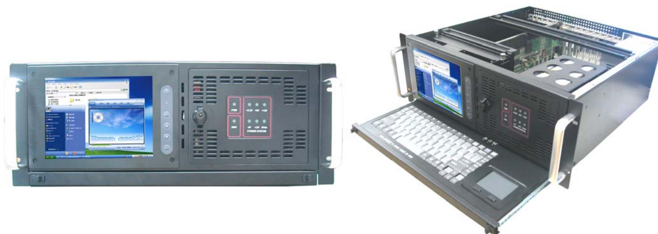
5U Rack Mount 10.4 TFT LCD workstation Front Accessible KB/Touch pad drawer