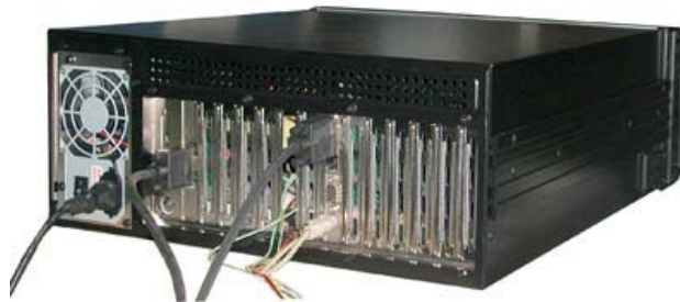
4U Rack Mount 8" TFT LCD workstation